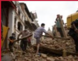
En la comunidad