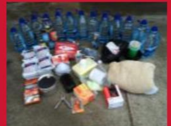
En la escuela

Vernon Elementary School 2044 NE Killingsworth, Portland, OR 97211